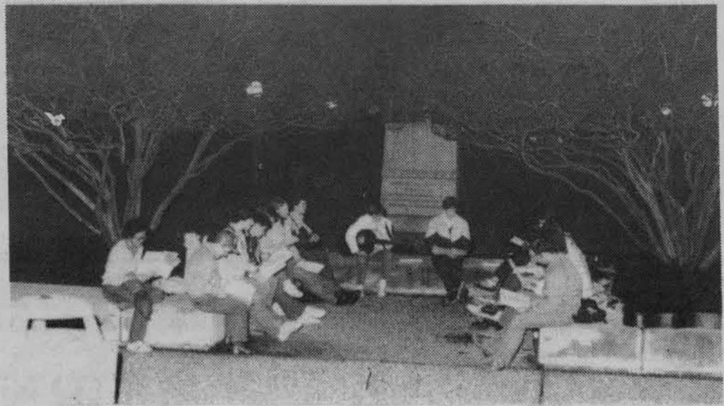
WEDNESDAY NIGHT STUDY BREAK